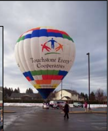
KEC member Hazel Raeder, Post Falls, 84, takes a ride in the Touchstone Energy hot air balloon. She said she had always wanted to go on a balloon ride and “it was fantastic!”

Tall trees, such as: maple, oak, spruce, and pine